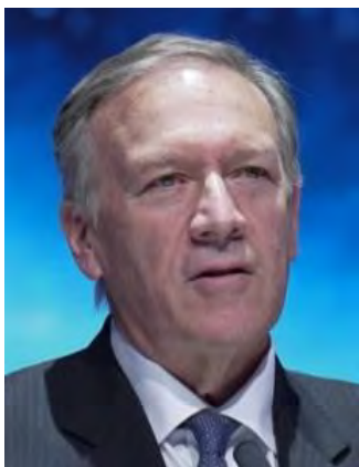
Mike Pompeo speaking 13th Feb. 2022 in Gapyeong, South Korea during World Summit 2022

Communists are on the offensive and manipulate the democratic societies. It is said that even in major democratic countries, universities are deeply influenced by communists.