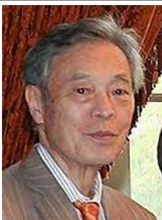
Keiji Kokuta from the Japanese Communist Party) - 30th March 2023

through various projects, stabilizing families in developing countries. However, after the assassination of former Prime Minister Shinzo Abe, the Women's Federation of Japan, who shared the same founders with the FFWPU , faced intense persecution.