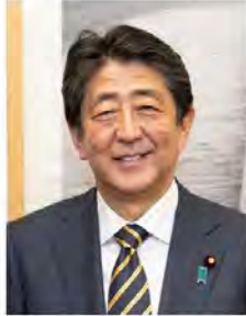
Shinzo Abe March 2022. Cropped