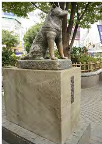
Hachiko, the Loyal Dog (忠犬八子公) at Shibuya station in Tokyo.

Ultimately, we must hold these demonstrations in Tokyo. (Applause) Thank you. I have been talking about this with the headquarters, but it seems they are not very enthusiastic about it at the moment. However, at this point, doing nothing is not an option. It's not like you do nothing; you hold symposiums nationwide. But you still have to make your case to the general public.