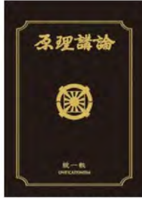
Front cover page of one version of Unification Principles in Japanese – 原理講論

However, it is really true that this is indeed religious persecution, and that the Family Federation is a legitimate religious organization. The teachings, such as the profound and systematic Unification Principles , make it a genuine religion, perhaps even more so than organizations like Soka Gakkai. (Applause)