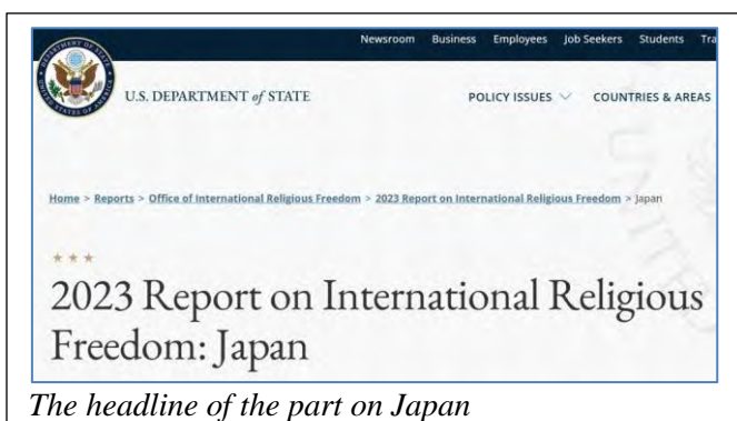
The headline of the part on Japan

The 2023 Report on International Religious Freedom was published 26th June 2024 by the U.S. Department of State. Its yearly report on religious liberty is considered the most comprehensive of its kind published internationally. The 2023 report "documents systematic, ongoing, and egregious violations of religious freedom that have occurred in the last year". It also "provides recommendations to the U.S. government intended to deter religious persecution and promote freedom of religion and belief abroad."