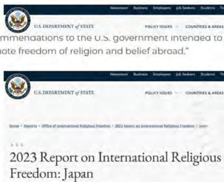
The headline of the part on Japan

“The Family Federation officially says it has 560,000 followers in the country (approximately 0.45 percent of the population). In a September 22 press conference, Family Federation director general for promoting the reform of the Church Teshigawara Hideyuki stated the church has nearly 100,000 active followers in Japan (approximately 0.08 percent of the population).” (Section I. Religious Demography)