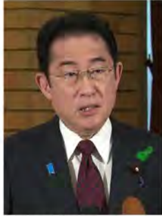
Prime Minister Fumio Kishida violating religious freedom. Here, 16th April 2023.

"As far as I know, I personally have no connection with the said organization. [...] To dispel public doubts, during this Cabinet reshuffle, I instructed ministers to inspect their relationships with the organization in question, take responsibility as politicians, and to make strict revisions based on the results. Only those who understood and agreed to this were appointed."