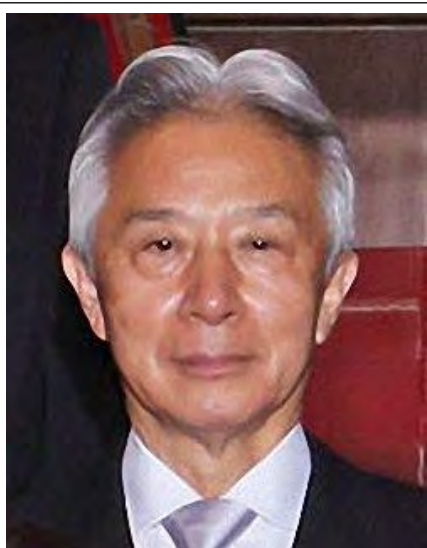
Masahito Moriyama, Minister of Education, Culture, Sports, Science and Technology (MEXT) 2023

See the first article , second article , third article , fourth article , fifth article