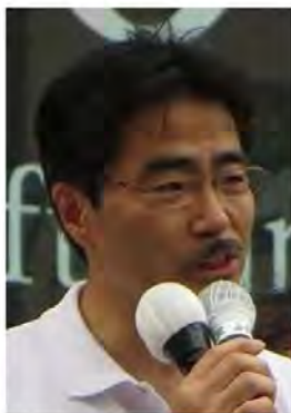
Masaru Wakasa, lawyer and politician.

answering questions about the details of the government’s internal deliberation process.” The names of the participants were not disclosed . Furthermore, the decisions (interpretation changes) made at this meeting have not been subsequently ratified by the Cabinet. There is a strong suspicion that this significant interpretation change was decided by a very small number of close aides in an unofficial gathering .