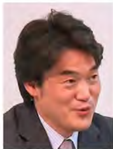
Hiroyuki Konishi.

"As for the main body of the former Unification Church , no final judgment has established criminal responsibility . [...] As the director of the Agency for Cultural Affairs has consistently stated, unless the government changes its interpretation, a dissolution request can never be made. "