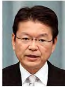
Akira Nagatsuma 8th June 2010.

Akira Nagatsuma (長妻昭), a member of the Constitutional Democratic Party (CDP), persistently urged Prime Minister Kishida to reconsider his interpretation of the dissolution requirements for religious corporations . The requirements are in line with the 1995 Tokyo High Court decision (confirmed by the Supreme Court in 1996). Nagatsuma argued against Prime Minister Kishida's assertion that "acts that are unlawful according to the Civil Code are not included" in the prohibitions and directives specified by criminal law and other established regulations, as indicated by Tokyo High Court. Nagatsuma said,