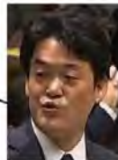
Shinzo Abe in 2020 Photo: Nendo Shigeki License: CC BY 4.0 ICP

Tokyo paper reveals how small clique around Kishida overnight changed interpretation of law crucial to religious freedom