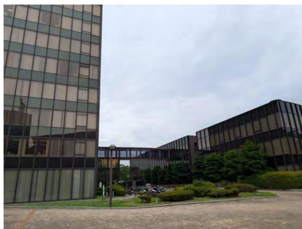
Kitakyushu City Hall (left) and City Council