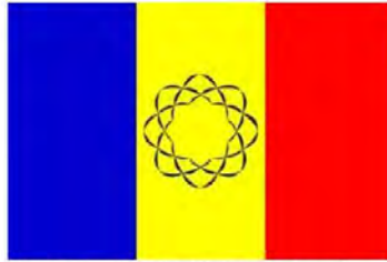
The Soka Gakkai International flag.

with socially problematic organisations, those taking a stance against the Liberal Democrats can continue to point out the social problems of other religious organisations, such as the Soka Gakkai [創価学会 – the new Buddhist movement on which the political party Komeito is based, the governing Liberal Democratic Party's coalition partner]. They can say, "Why do you declare you have cut ties with the former Unification Church (Family Federation for World Peace and Unification), but not with other religious groups?" It would not be a situation where they could form a coalition. It can be said that Prime Minister Kishida without thinking has destroyed the identity of the Liberal Democratic Party.