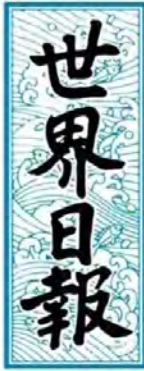
Logo of the Sekai Nippo

thought and religion" (思想・宗教統制) we are not aware of.