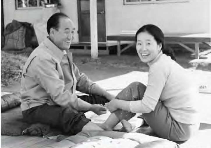
Father and Mother Moon in Gapyeong, South Korea in the late 1960s.

There's the early life of both Father and Mother Moon separately before the Holy Blessing.