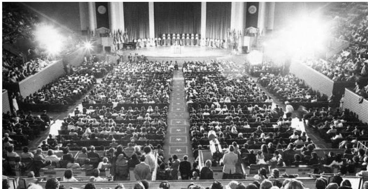
From one of the meetings with Father Moon in Washington DC in October 1973

The speech "God's Hope for America", is the version Father Moon delivered in Washington DC 21st October 1973. Here, Sun Myung Moon discusses the pivotal role he believes the United States plays in God 's providence and the realization of a world centered on divine love and principles. He argues that America was founded with a special purpose and divine blessing, destined to lead the world towards peace and unity under God .