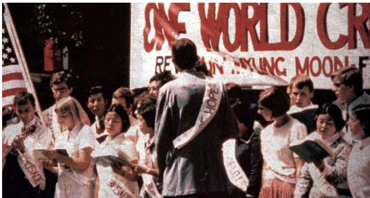
From a street rally promoting one of the speeches of Father Moon during 21-city speaking tour in 1973

transcend their differences and work together towards common goals, emphasizing the need for a unified front in addressing global challenges and advancing God's kingdom on earth.