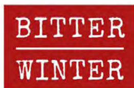
The logo of Bitter Winter

" Bitter Winter , the magazine dedicated to religious freedom and human rights, is a successful original enterprise that combines media people, activists, and scholars who are deeply committed to defend freedom of religion or belief (FoRB) for everyone, everywhere, always, and to denounce the persecution of believers.