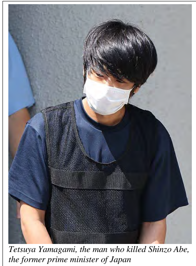
Tetsuya Yamagami, the man who killed Shinzo Abe, the former prime minister of Japan

The Family Federation was in fact made somewhat responsible for it to the point of requesting its dissolution as a religious organization.