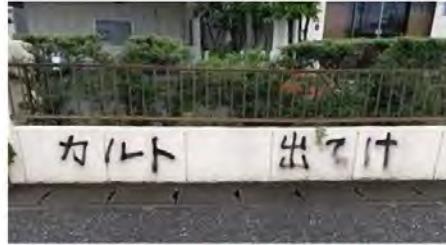
Graffiti sprayed on Family Federation facilities in Japan after the Abe assassination in July 2022.

The Family Federation announced that it will present these details in writing to Tokyo District Court during the hearings for the dissolution order requested by the Kishida administration. The religious organization also reported recurring incidents of graffiti with messages like "Traitor cult" and "Cult, get out," along with nuisance phone calls at churches in various locations across the nation.