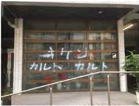
Graffiti sprayed on Family Federation facilities in Japan after the Abe assassination in July 2022.

The huge number of open hostilities against the Family Federation include graffiti sprayed on cars, and windows of church facilities being broken during prayer sessions.