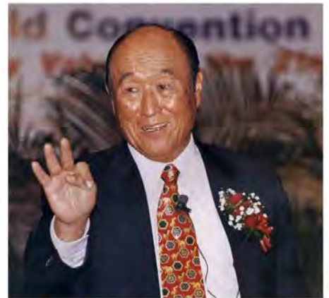
Sun Myung Moon 1st August 1996