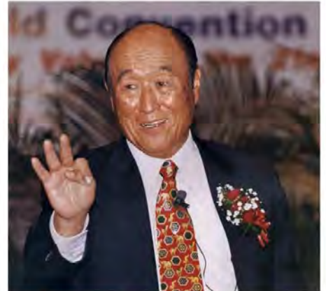
Sun Myung Moon 1st August 1996