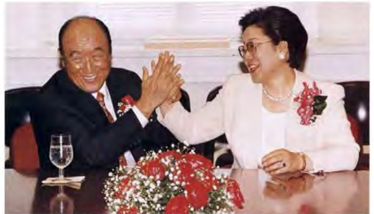
Father and Mother Moon 1st August 1996.