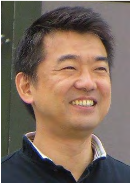
Toru Hashimoto, Japanese TV personality, politician, and lawyer (2013)

At the end of June this year, nearly two years after the assassination of Shinzo Abe, the defense team that met with the accused Yamagami revealed that he said, regarding the government's request for a dissolution order against the religious organization , "I never expected this situation to arise" (Nikkei Shimbun). He also stated, "Before the incident, I was cornered and did not foresee what was to come."