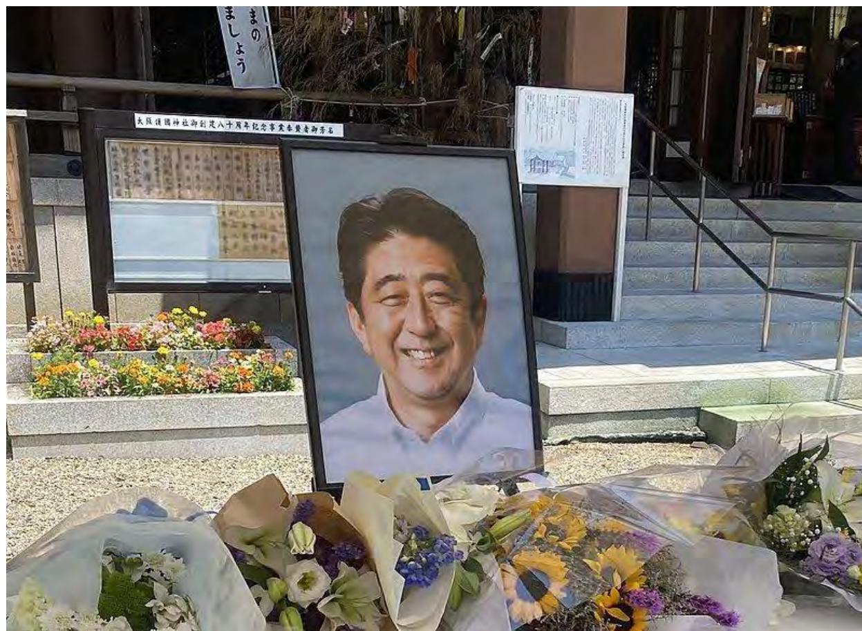
A floral tribute stand set up at Osaka Gokoku Shrine on 6th July 2024, on the occasion of the second anniversary of the death of former Prime Minister Shinzo Abe