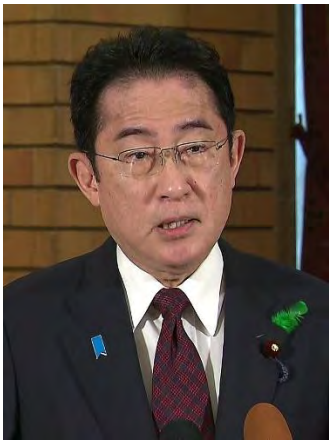
Prime Minister Fumio Kishida April 16 2023, the day after a bomb was thrown at him