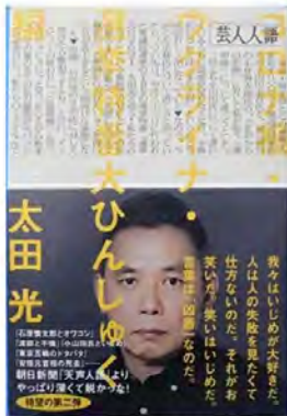
The front page cover of "Geinin Ningo: Corona Pandemic, Ukraine, and Election Special - The Great Displeasure Edition" by Hikari Ota, published on Asahi Shimbun Publishing.

"TV has become obsessed with pursuing the connections between Liberal Democratic Party (LDP) members and the former Unification Church . I think TV has a bad habit of getting 'overheated' in one direction."