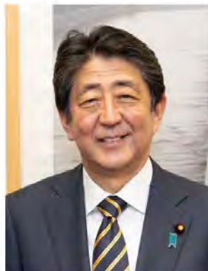
Shinzo Abe in March 2022, just months before his assassination.

"Is it really okay to base our understanding of the entire incident on fragments of statements we've heard and turn it into a discussion about 'politics and religion'?"