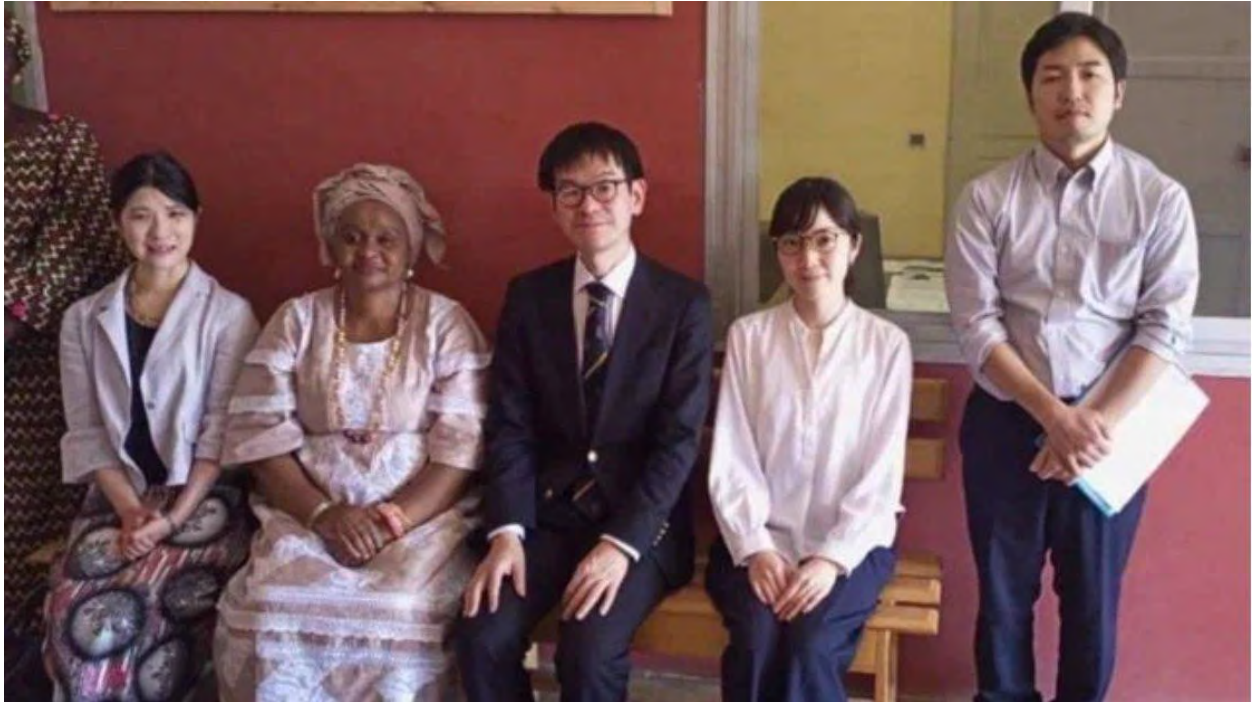
Japanese Foreign Ministry envoys at the JAMOO2 school in Senegal

BITTER WINTER Investigative journalist uncovers Kishida administration's embarrassing cover-up scandal in Africa to appease Japanese communists