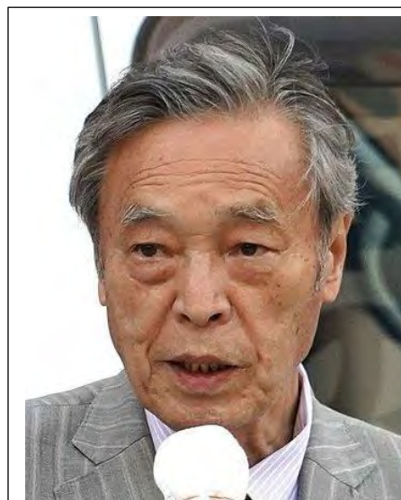
Keiji Kokuta giving a speech at local elections in Kumamoto City, Japan on 3rd April 2023

Ministry, in April 2023, sent a delegation to Senegal not to support the school, but to remove all visible links between the WFWP and JAMOO2. This included erasing logos, altering contact details, and even dismissing a long-serving teacher, in an attempt to distance the project from the Unification Church .