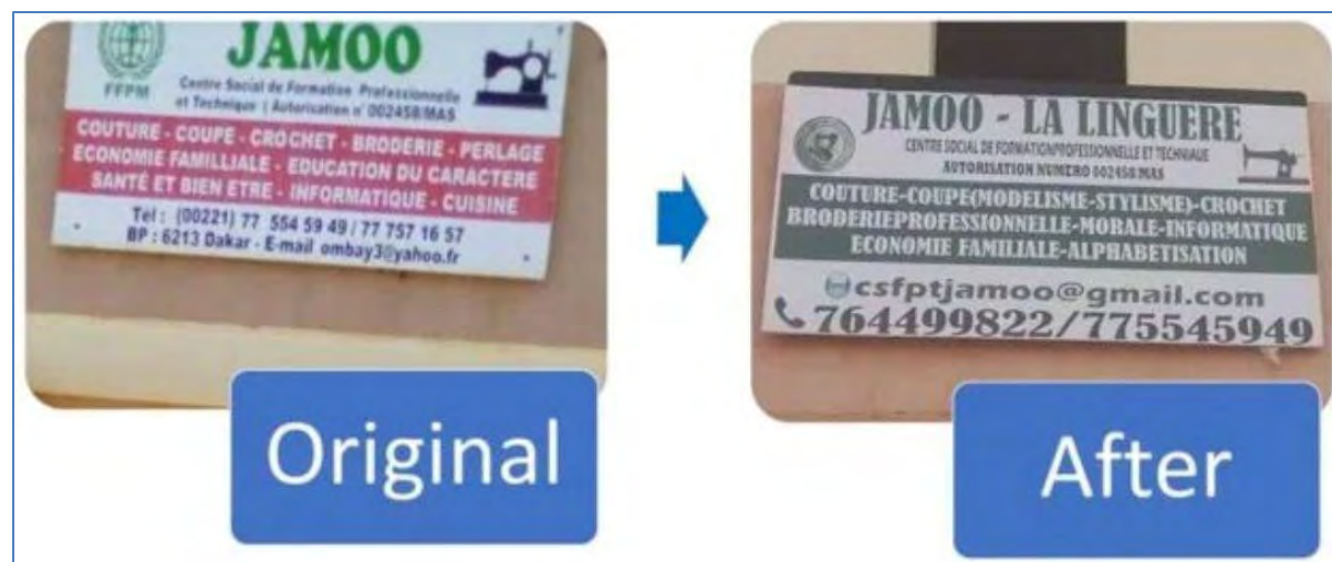
The logo, school name, phone number, and email address had to be changed in the school sign

heavy-handed manner, leaving her little choice but to comply in order to protect the school.