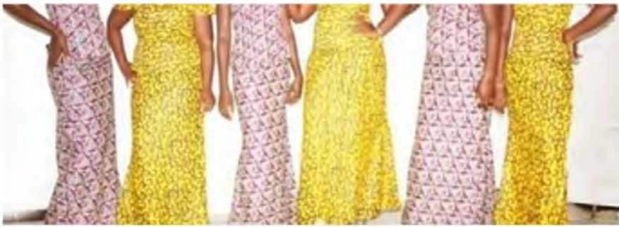
JAMOO school graduates.