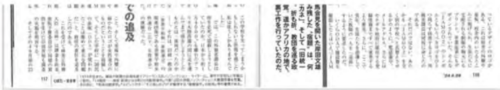
The longer version of the article in the "Weekly Shincho."