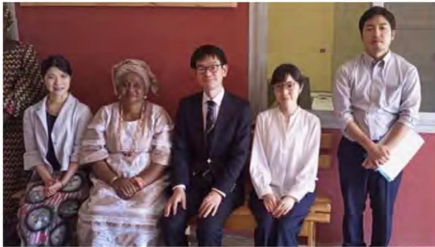
Japanese Foreign Ministry envoys at the JAMOO2 school in Senegal.

The "Weekly Shincho" is generally regarded as one of the most influential magazines in Japan. It has a conservative orientation. It is very significant that, within the context of Prime Minister Kishida's announcement that he will step down from his position, the magazine published a report by award-winning investigative journalist Masaaki Kubota on the obnoxious activities of Kishida's Ministry of Foreign Affairs in Senegal.