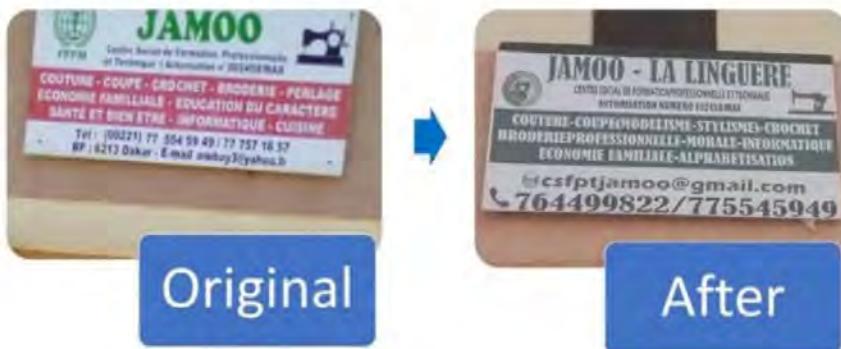
The logo, school name, phone number, and email address had to be changed in the school sign.

As the "Shincho" notices, "In the photo of the handover ceremony mentioned earlier, a banner is hung next to the entrance of the school building, and when you enlarge it, you can see the logo of a person standing on a globe-like figure next to the school's name 'JAMOO.' This logo is hung on the exterior walls and signs of the school building and is also printed on the chest of the uniforms provided to students and on their graduation certificates. The Ministry of Foreign Affairs' section chief ordered the school to erase all the logos, which could be said to be the symbol of 'JAMOO2.' They also demanded that the phone number, email address, and even the registration information submitted to the Senegalese government be changed, as if to transform 'JAMOO2' into a completely different school. They also demanded that one of the teachers who had been teaching the students there for many years be 'expelled.'"