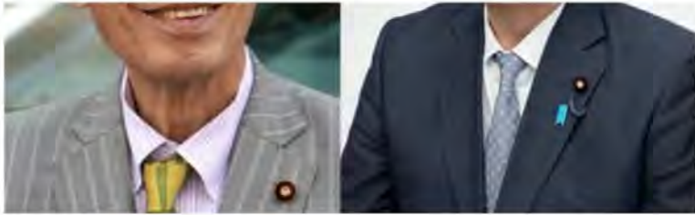
Communist MP Keiji Kokuta (left, credits) and former Foreign Minister Yoshimasa Hayashi (right, credits).