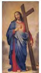
Public domain image. Cropped