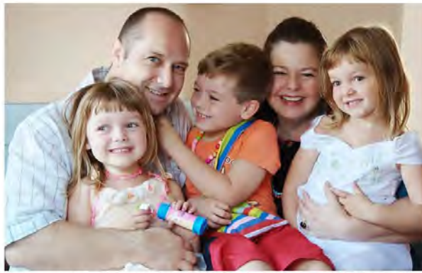
A happy family in 2012.

Through our tradition of Blessings , as we call them, we believe that God should be a central part of a person's life and family life.