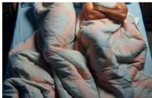
Waking up.