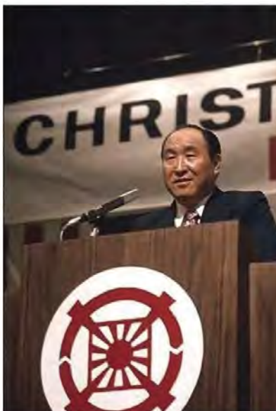
Father Moon during 21-city speaking tour 1973/74.

He spoke three evenings in each city and held these speeches: "God's Hope for Man", "God's Hope for America" and "The Future of Christianity". The 21 cities were New York, Baltimore, Philadelphia, Boston,