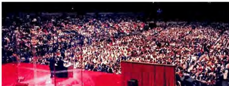
Father Moon speaking in Madison Square Garden, New York 18th Sep. 1974.