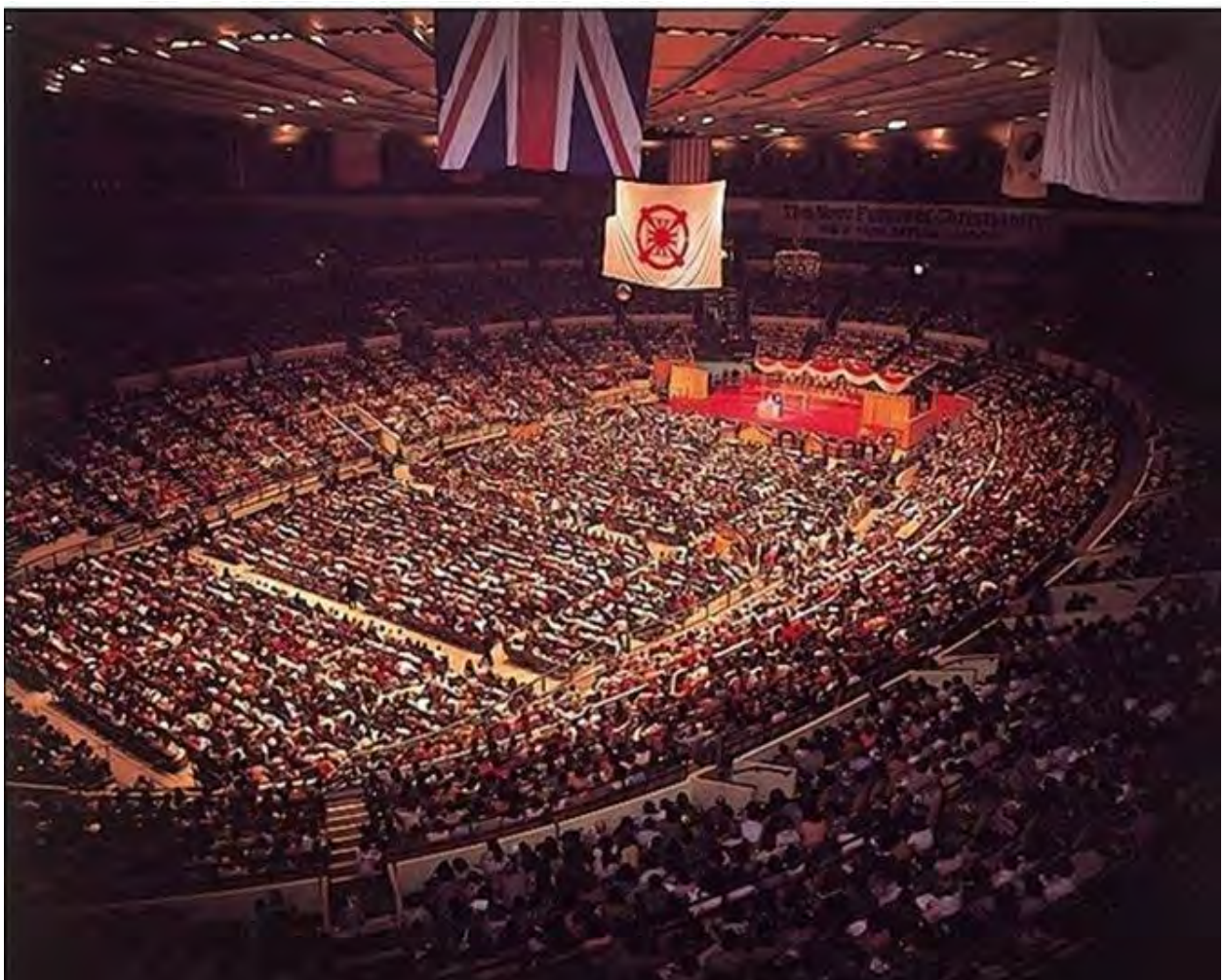
From the rally at Madison Square Garden, New York on 18th September 1974

50 years since large historical rally at Madison Square Garden, New York, where Father Moon proclaimed "The New Future of Christianity"