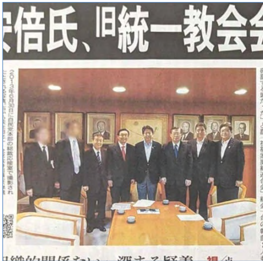
Asahi Shimbun 17th September 2024