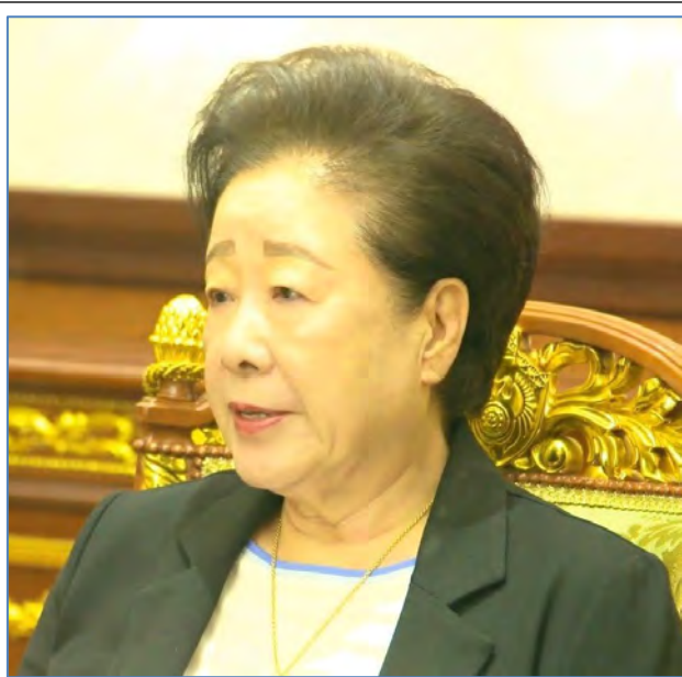
Mother Moon at international leaders' meeting in Gapyeong, South Korea 6th September 2024

We turned around in 20 hours, and went back to Korea. "Why?" you may ask. Well, that's what I want to share with you this morning.