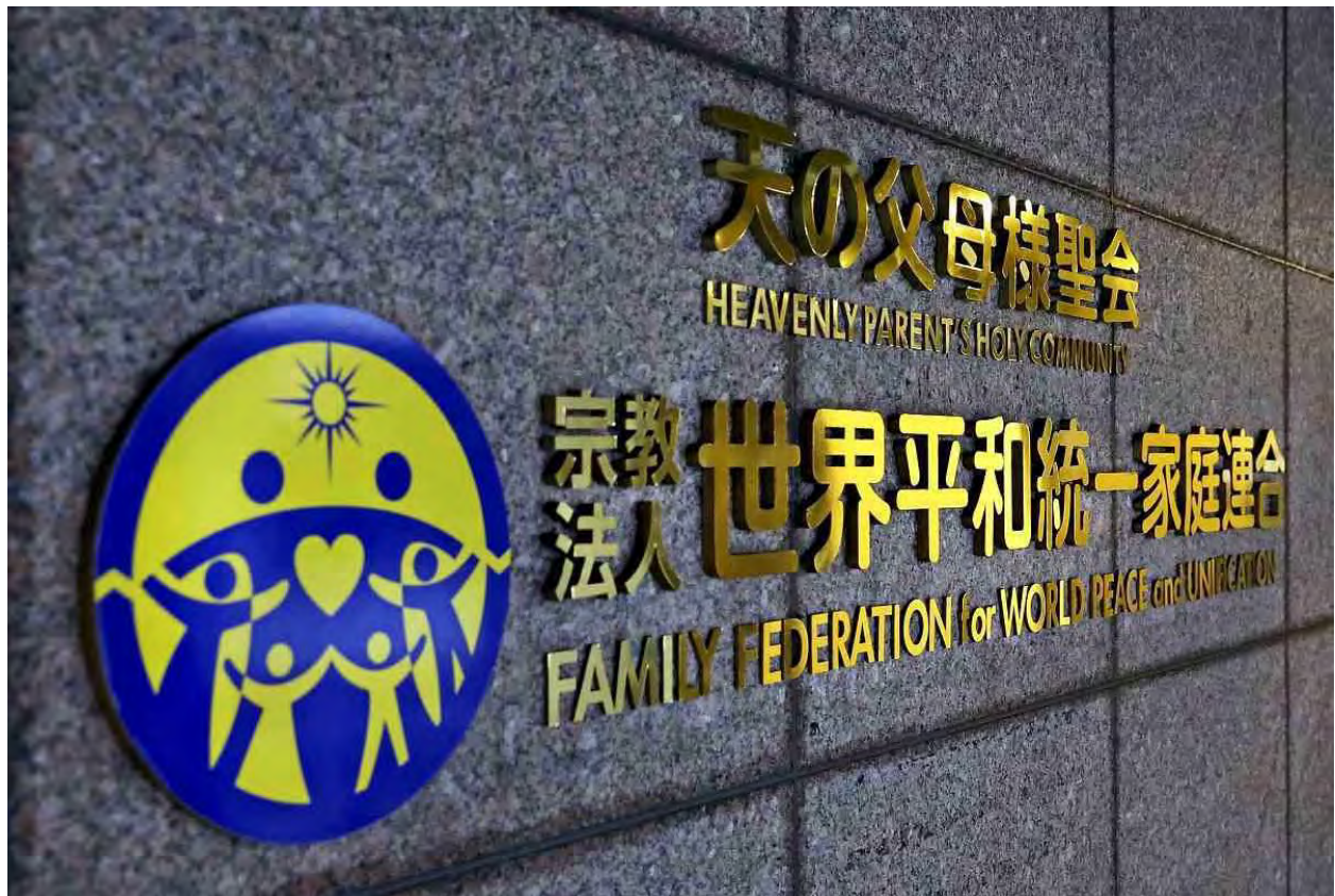
Sign at the entrance of the headquarters of the Family Federation of Japan in Shibuya, Tokyo