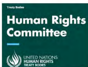
From header of the webpage of the Human Rights Committee, a subpage on the site of the UN Human Rights Office of the High Commissioner

It is important to highlight that over the years, the UN Human Rights