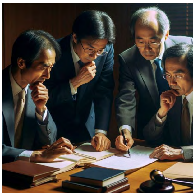
Japanese lawyers discussing consumer law