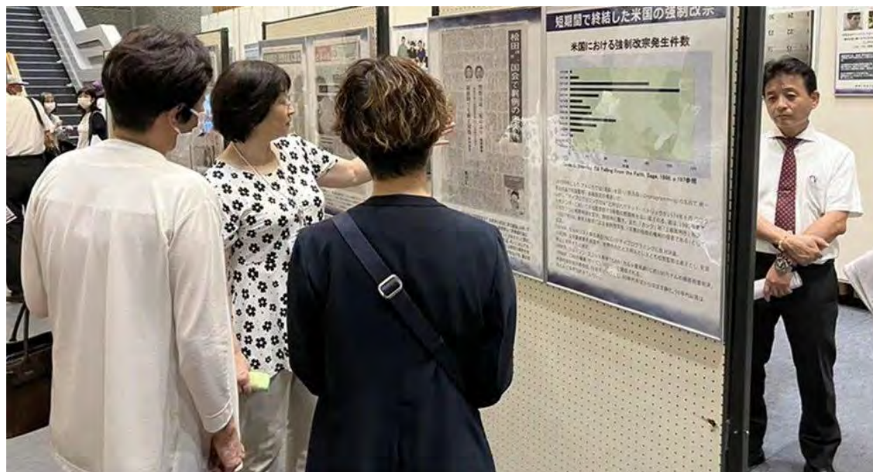
Participants receiving explanation of the panels on 29th September 2024, in Kumamoto City, Kyushu, Japan