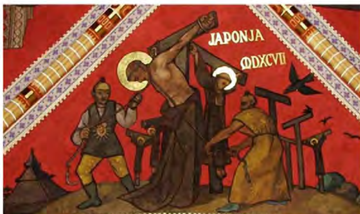
From Japan's history of religious persecution. Here, scene from a painting depicting the 26 martyrs of Japan, a group of Catholics martyred by crucifixion in Nagasaki 5 th February 1597. Photo: Abraham / Wikimedia Commons. License: CC Attr 3.0 Unp. Cropped