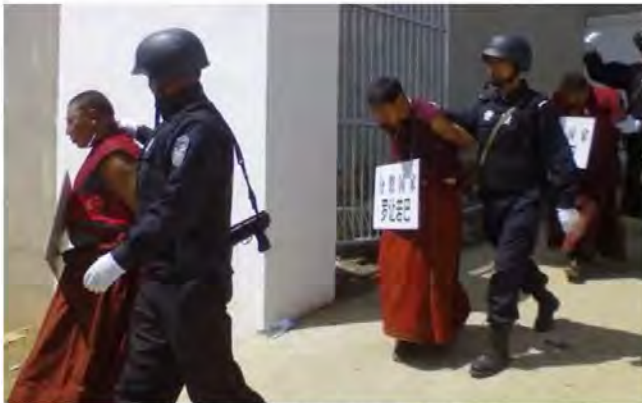
Persecution in China: Tibetan Monks arrested in 2008.

protest letter the 12 signatories state bluntly that a dissolution of the Family Federation will be a step similar to anti-religious measures used in nations like communist China and Putin's Russia, and that do not belong in a democratic country like Japan.