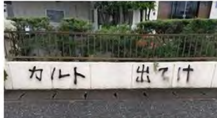
Graffiti sprayed on Family Federation facilities in Japan after the Abe assassination in July 2022.

The Family Federation announced that it will present these details in writing to Tokyo District Court during the hearings for the dissolution order requested by the Kishida administration. The religious organization also reported recurring incidents of graffiti with messages like "Traitor cult" and "Cult, get out," along with nuisance phone calls at churches in various locations across the nation.