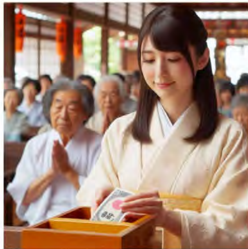
Faithful believer offering donation.

(deprogramming): In many rulings, the courts referred to the "victims" as having been "rescued" or "protected," which is essentially another way of describing faith-breaking (deprogramming). This suggests that individuals were coerced into renouncing their faith and encouraged to file lawsuits against the Unification Church . Since their original donations were made when they still held strong beliefs, the cases may have been constructed against the church, with coercion being necessary for devoted members to abandon their convictions . It is notable