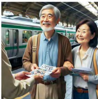
Japan: Activist leftwing lawyers aim to make evangelical outreach into "wrongful conduct". Here, a friendly-looking elderly couple handing out leaflets. Image generated by Microsoft Designer Image Creator 11th July 2024.

The concept of "social acceptability", an ambiguous and often discriminatory standard, is employed by the Japanese courts to limit the Unification Church's right to proselytize, turning its missionary efforts into wrongful conduct. One notable example is the ruling of the Tokyo High Court on 13 th May 2003, which MEXT cites among the 32 cases supporting its dissolution request. The court found that the plaintiffs were gradually introduced to the doctrines of the Unification Church , particularly the Divine Principle , through a series of seminars and workshops. These teachings slowly influenced their thinking, and as part of practicing the faith, the plaintiffs became involved in specific missionary and economic activities.