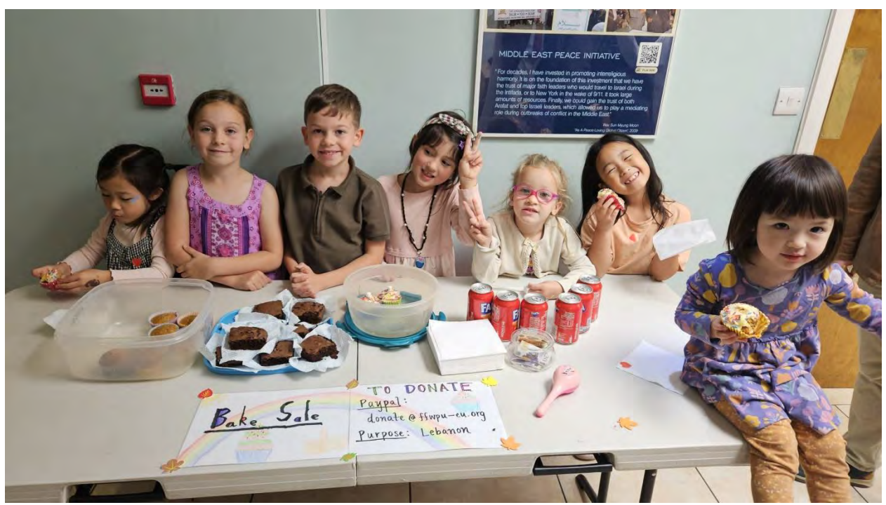
The River South Children's Ministry held a bake sale after Sunday Service on the 29th September