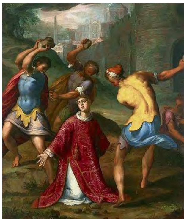
The stoning of Saint Stephen, the first Christian martyr. Painting by Hans von Aachen (1552-1615). Painting is now in Church of St. Stephen, Krakow, Poland

We're talking about Hebrews now, not about any other organisation you may have heard of that has experienced such problems. This was a time of persecution, but still, because such matters aroused passion, the church moved forward. But now in the stage that the writer is describing, the community has begun to lose power, they began to lose their spirit.