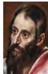
Saint Paul (ca. 10-67 AD), one of the apostles of the early church and author of several letters in the New Testament. From painting by El Greco, from Saint Louis Art Museum, Missouri, USA. Public domain image

"So I find this law at work: although I want to do good, evil is right there with me. For in my inner being I delight in God's law; but I see another law at work in me, waging war against the law of my mind and making me a prisoner of the law of sin at work within me. What a wretched man I am! Who will rescue me from this body that is subject to death?" (NIV)