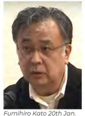
2024.