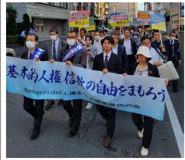
<u>Family Federation</u> believers rallying for freedom of religion 13th Oct. 2024 in Urawa Ward, Saitama City, Japan

Still more, related to bullying of religious minority: <u>Japan Criticized for Glaring Rights</u> <u>Violations</u>