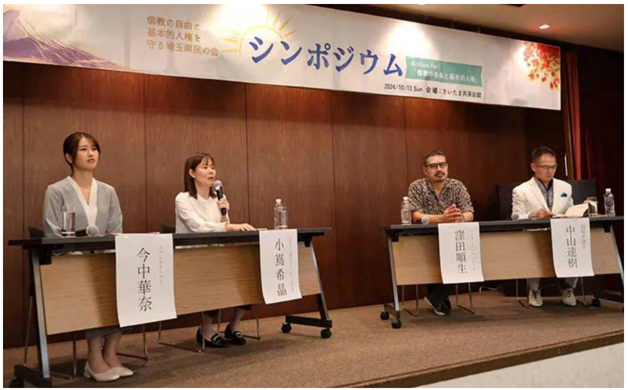
Speakers discussing the future vision of the <u>Family Federation</u> Oct. 13, 2024, Urawa Ward, Saitama City, Japan