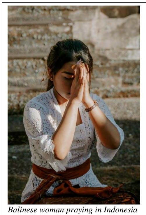
Balinese woman praying in Indonesia

They've also, but maybe less frequently, used the term "meditation". But still, our True Father especially has talked about quiet reflection and the importance of being in a state of mind where one can connect deeply with the divine.