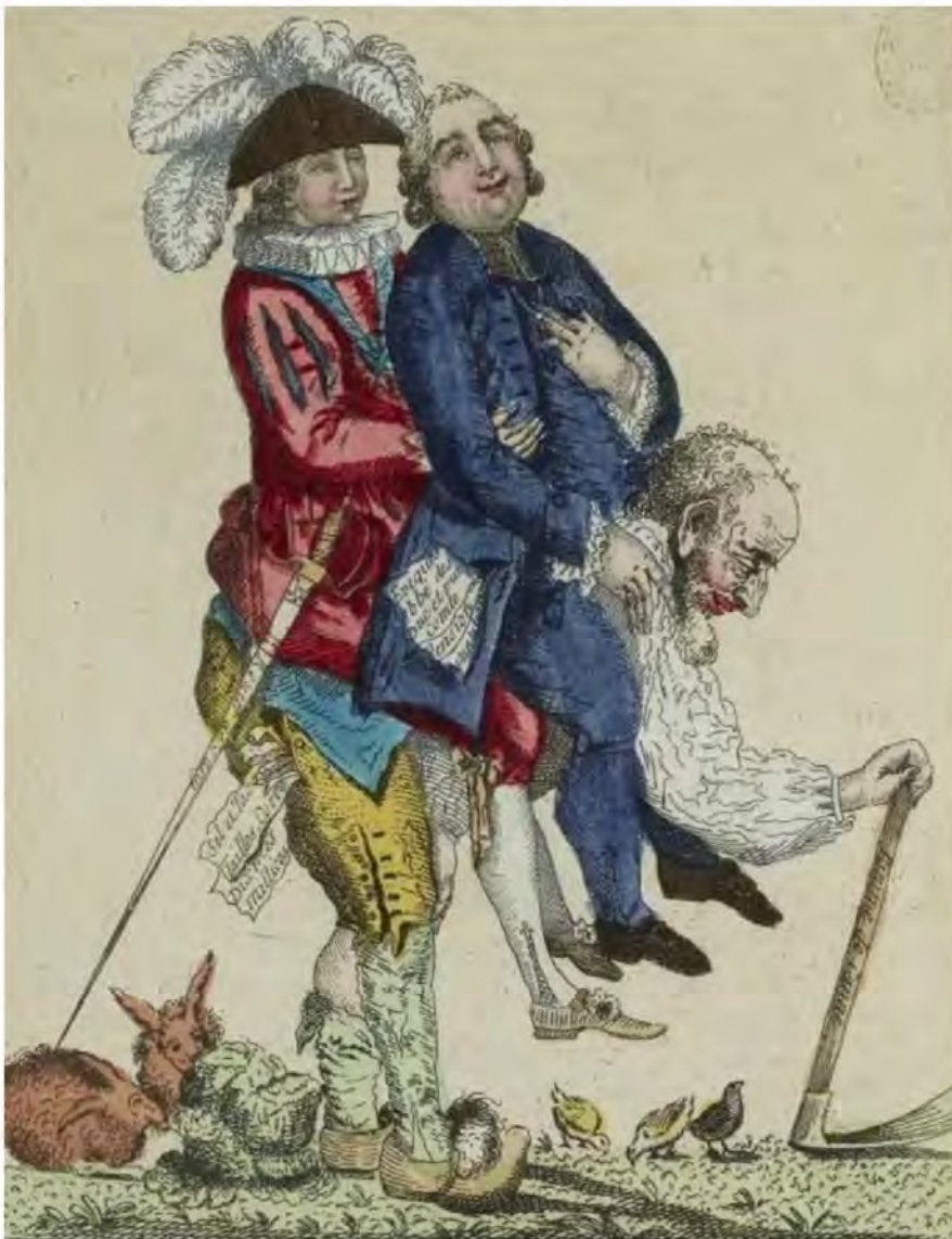
Historically, all religions were accused by opponents of enriching themselves by milking their devotees. Here, in a print from the years of the French Revolution, a priest supported by an aristocrat rides a poor peasant whose donations made him rich and fat.

In order to clarify the designation of designated religious corporations and specially designated religious corporations by MEXT pursuant to these provisions, the Government has issued Guidelines on 15 February 2024 "Criteria for Operation Concerning the Designation of Designated Religious Corporations and Specially Designated Religious Corporations Under the Law on Special Provisions for the Operation of the Japan Legal Support Center for Prompt and Smooth Relief of Victims of Specific Torts, and Similar, and Special Provisions of the Disposition and Management of Property by Religious Corporations."