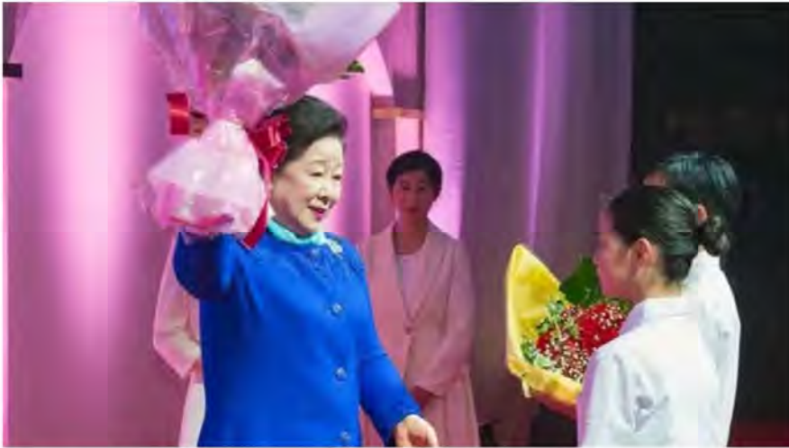
Unification Church leader Dr. Hak Ja Han Moon visiting Tokyo in 2017.

But above all, this State apparatus is designed at inciting those who donated to the Church to rescind their donations and claim damages, with the help of lawyers paid by the State.