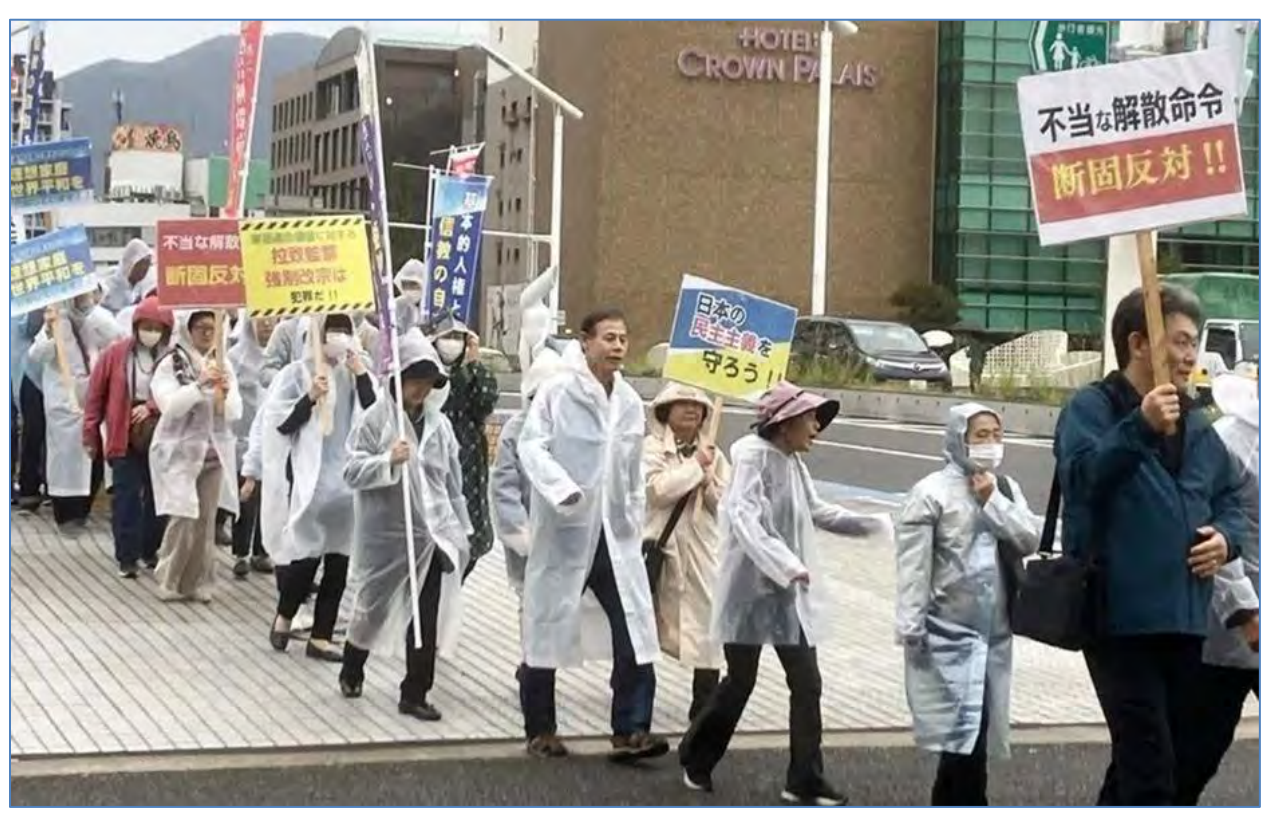
Pro Unification Church Demonstrators marching in the rain 10th November 2024, Kokurakita Ward, Kitakyushu City