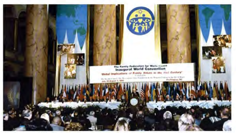
The Inaugural World Convention of the Family Federation 31st July 1996

"While the world's finest athletes test themselves in Atlanta, this