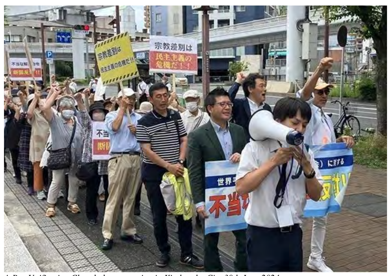
A Pro Unification Church demonstration in Kitakyushu City 30th June 2024

In December 2022, the Kitakyushu City Council unanimously passed a resolution affirming its stance not to associate with the "anti-social former <u>Unification Church</u>". The <u>religious organization</u> subsequently filed a lawsuit against the city in August 2023, seeking 11 million yen in damages, arguing that the resolution constituted defamation and religious discrimination and was therefore unlawful. The court ruling in this case is scheduled for 20th November 2024.