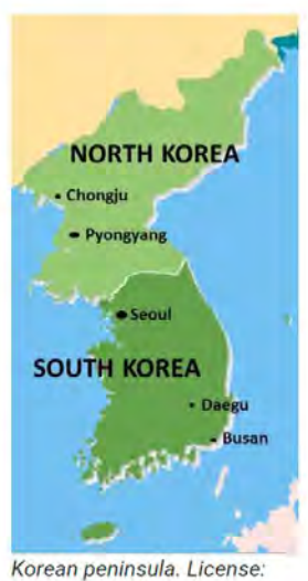
CC ASA 3.0 Unp

However, the Unification Church was discontinued in 1997. Then Father Moon