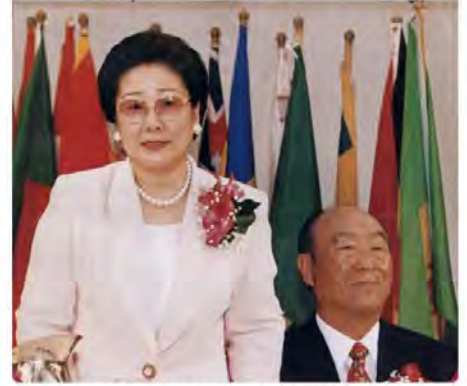
Mother and Father Moon 31st July 1996

The chronicle "40 Years in America" describes the event,