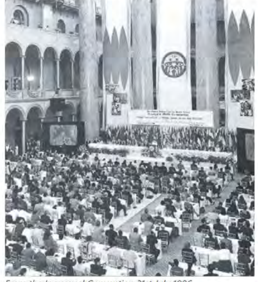
From the Inaugural Convention 31st July 1996