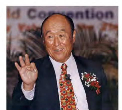
Sun Myung Moon 1st August 1996

'Religious organizations have always been centered upon the salvation of the individual, but we have now progressed to the salvation of the family. [...] Such an organization is not a church; it is the Family Federation for World Peace.'