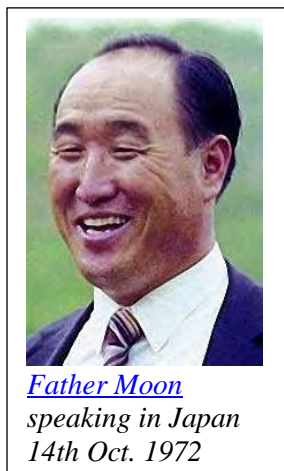
Father Moon speaking in Japan 14th Oct. 1972