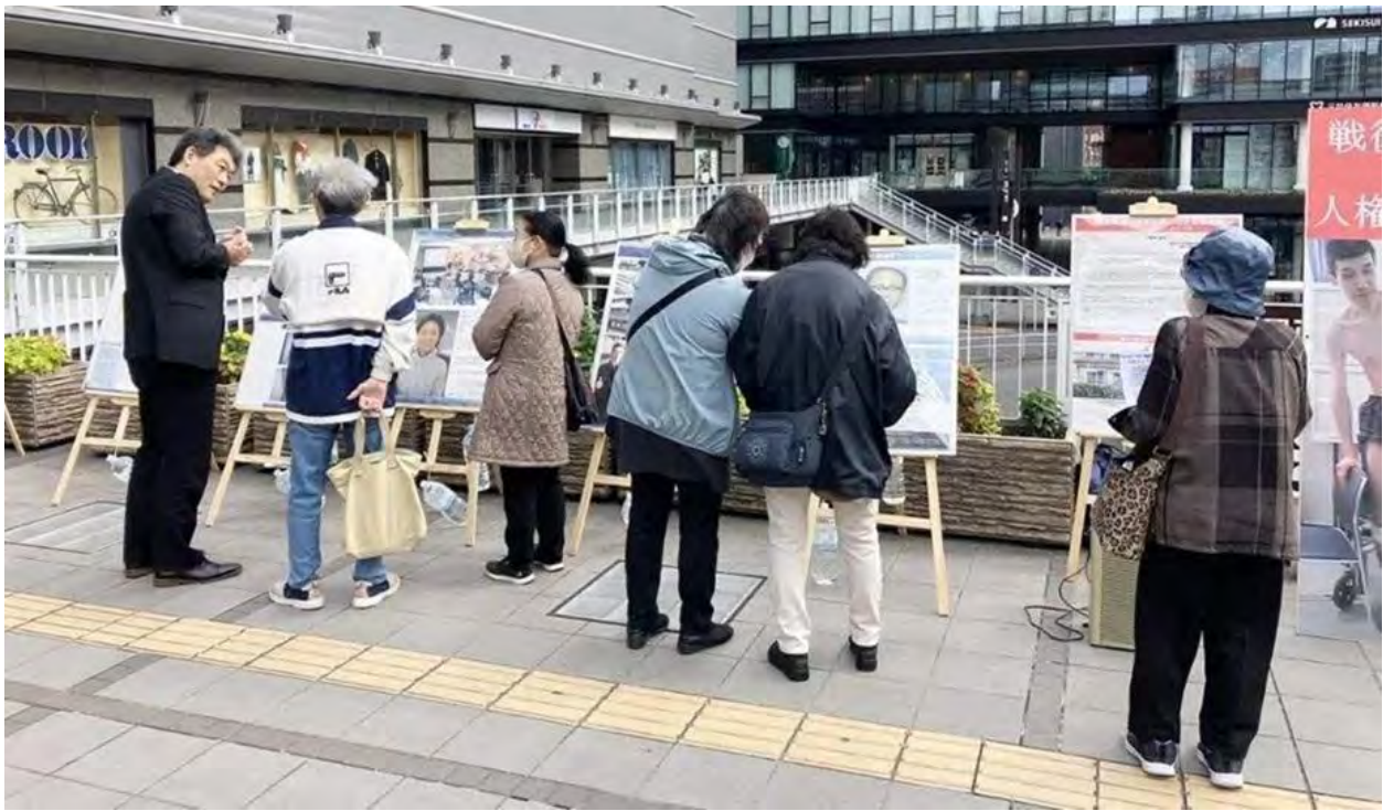
A panel exhibition on victims of abduction held at the south exit of Kokura Station in Kitakyushu City on the southern island of Kyushu, Japan on 18th November 2024

Panel exhibition reveals the horrors of persecution in Japan, the land of abduction, confinement, and forcible faith-breaking