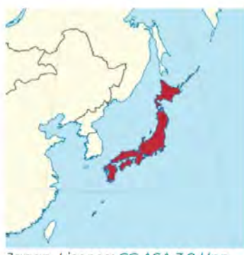
Japan. License: CC ASA 3.0 Unp. Cropped

In Japan, thousands of converts to the Unification Church and about 200 to the movement of Jehovah's Witnesses have during four decades been victims of abduction and attempts of forced deconversion in long-term confinement conditions: weeks, months and sometimes years. The Japanese media outlets always kept silent about these massive violations of human rights but were very prolific in their politically motivated campaigns stigmatizing the Unification Church as a