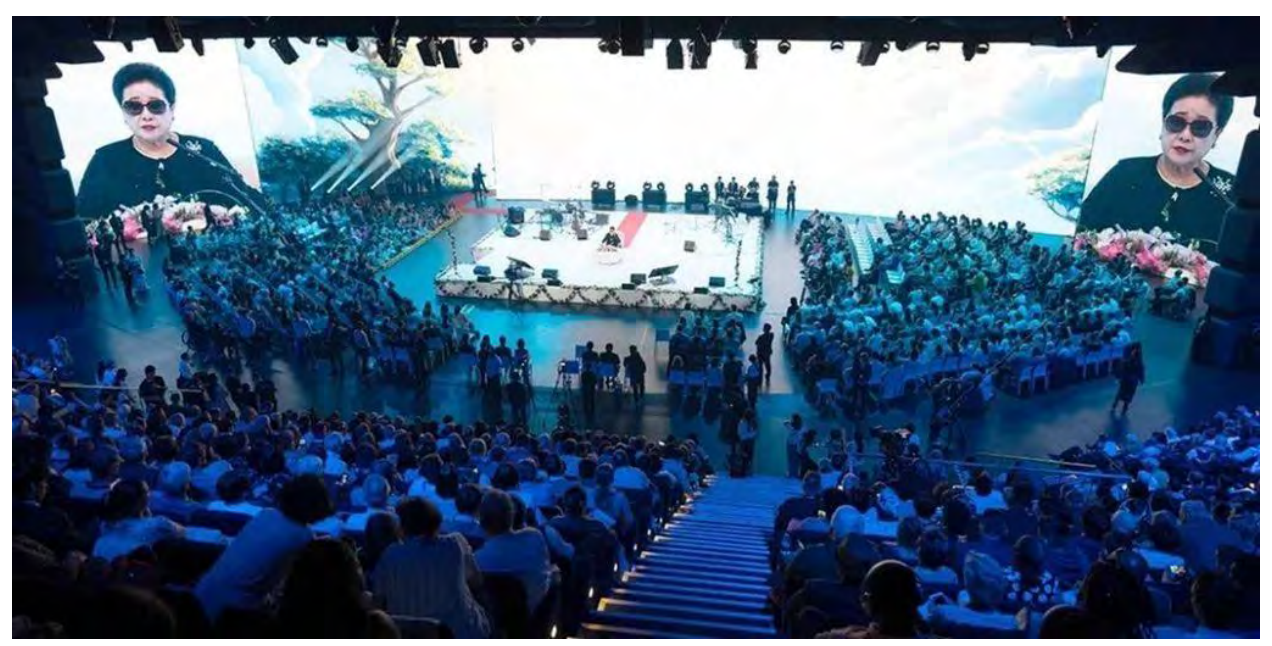
Mother Moon on stage during the Bloom Festival, in Showpalast, Munich, Germany 19th May 2024

I remember when Mother came to Munich. Did any of you go to Munich for the Bloom festival?