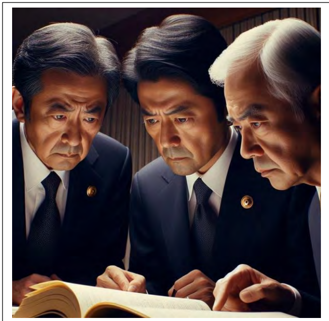
On advice from hostile activist lawyers, the Japanese government changed the law to make it easy for many to exploit new laws and pose as victim to sue the Family Federation

with lawyers and pose as victims to sue and extort money, exploiting these laws for financial gain. This 'victim business' is becoming a form of organized crime."