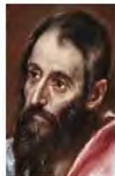
Saint Paul (ca. 10-67 AD), one of the apostles of the early church and author of several letters in the New Testament. From painting by El Greco, from Saint Louis Art Museum, Missouri, USA.

"So I find this law at work: although I want to do good, evil is right there with me. For in my inner being I delight in God's law; but I see another law at work in me, waging war against the law of my mind and making me a prisoner of the law of sin at work within me. What a wretched man I am! Who will rescue me from this body that is subject to death?" (NIV)