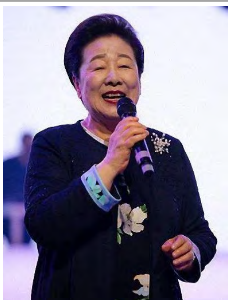
Mother Moon speaking in Munich, Germany 19th May 2024

You may have heard so much about it that you don't want to hear anymore, but the bad news is you're going to hear about it one more time today.