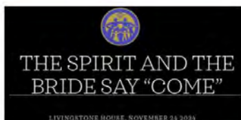
Illustration 24th Nov. 2024. Screenshot