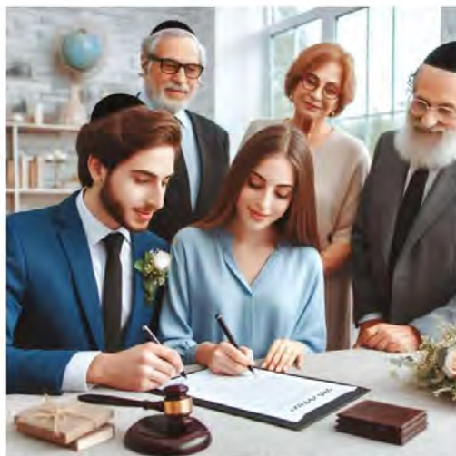
Marriage contract being signed by young Jewish couple.

But then if they agreed and signed the contract, what would happen is that the bride would go back to her parents, and the bridegroom would go to get ready. It was not just to change his suit, but to get a house, to prepare everything so that he could welcome his new bride.