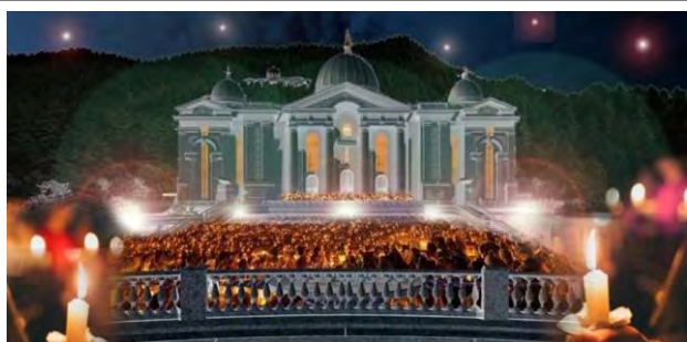
Prayer vigil at night at Cheonwon Gung

"Our loving, Heavenly Parent, it's sometimes hard for us to realise that your providence is moving forward. Because we can all see the chaos and disaster in our world and the suffering and misery that still continues thousands of years after Adam and Eve left the garden.