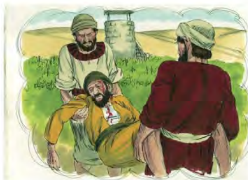
The messengers were beaten up. Image: Biblical illustration of Gospel of Luke. Distant Shores Media/Sweet Publishing. License: CC ASA 3.0 Unp

But they don't. In fact, not only do they not; they go off, one to his field, another to his business, and the rest actually seized the messengers and beat them up.