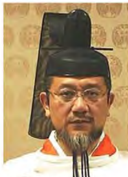
Rev. Yoshinobu Miyake. Photo (2015): Yujiro.adreva / Wikimedia Commons. License: CC ASA 4.0 Int. Cropped

"In the National Diet, which is the source of democratic power, lawmakers have turned a blind eye to the social annihilation of a particular new religious movement due to fears of being associated with it. Furthermore, the mass media has taken on the role of judge."