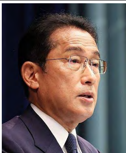
Fumio Kishida July 14, 2022

that teaches the importance of the family?