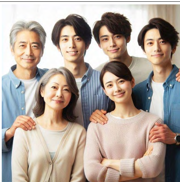
The family is at the core of the teachings of the Family Federation

These members often prioritized the goal of world peace over their own families and set out on global missions with a strong sense of purpose. Among many members who shared this mindset, there was a tendency to lose balance, which led to irregularities (歪) within their families.