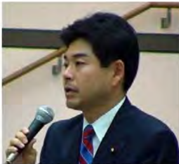
Kazunori Yamanoi, Japanese politician of the Constitutional Democratic Party, a member of the House of Representatives in the Diet (national parliament) 2000-2017 for DPJ and again since 2021 for CDP.

"A dissolution order must be issued before the mass wedding ceremony takes place. If it is delayed, it could lead to children born from the mass wedding asking, 'Why didn't you stop it?'"