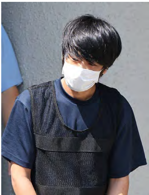
Committed heinous crime: Tetsuya Yamagami, the man who killed Shinzo Abe, the former prime minister of Japan

Sekai Nippo: It has been reported that Tetsuya Yamagami (山上徹也), the suspect in the shooting of former Prime Minister Shinzo Abe (安倍晋三), stated that his motive for the crime was linked to the substantial donations his mother made to the Family Federation for World Peace and Unification (formerly the Unification Church ) after becoming a member. How do you respond to the suggestion that the circumstances of members' families contributed to this tragic incident?