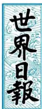
Logo of the Sekai Nippo

Japanese politician censured for his attack on religious minority when using Nazi ideas and the same kind of totalitarian thinking and eugenics ideology as that of Hitler