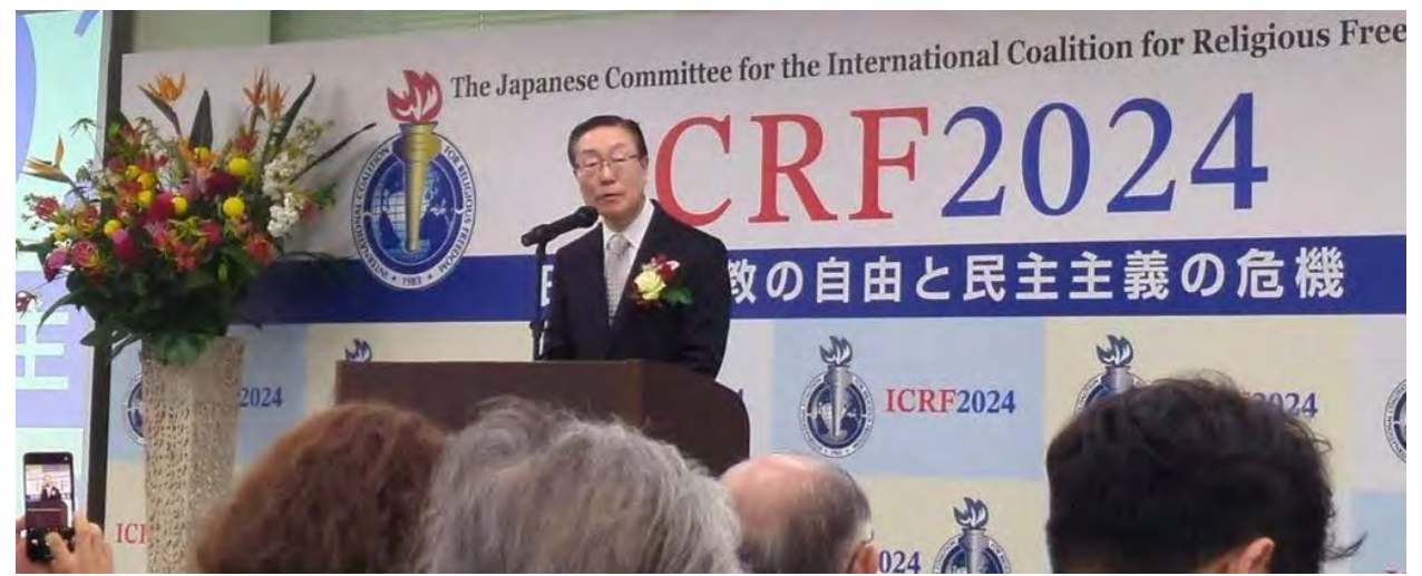
The ICRF conference on religious freedom December 8, 2024 in Tokyo, Japan

American Christian leader reveals how a steadily increasing number of important leaders around the world have become seriously concerned about Japan and its appalling record on violations of freedom of religion