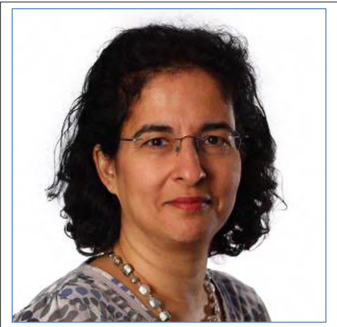
Sent formal UN request to Japan, but no reply: Nazila Ghanea, UN Rapporteur on Religious Freedom since February 2023

The UN Rapporteur on Religious Freedom made a formal request to the Japanese government to visit Japan to investigate the possible violations of religious freedom against minority religions. But the nation of Japan has denied her request. This rejection of her request is listed on the United Nations website.