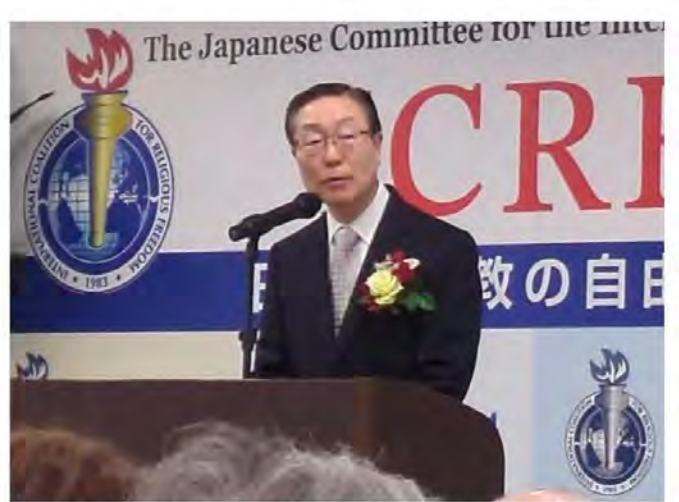
Tomihiro Tanaka speaking in Tokyo 8th December 2024.

Japan Committee of the International Religious Freedom Alliance (ICRF), a group of experts dedicated to protecting people from religious prejudice and oppression domestically and internationally, held a lecture event titled "The Crisis of Religious Freedom and Democracy in Japan" in Tokyo on 8<sup>th</sup> December 2024. During the event, Reverend Paula White, religious advisor to the incoming U.S. President Donald Trump, sent a video message, expressing that