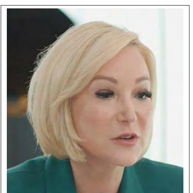
Paula White delivering a video message at a conference on religious freedom in Tokyo December 8, 2024

Prefecture Peace Ambassadors Council. Approximately 2,300 attended the rally.