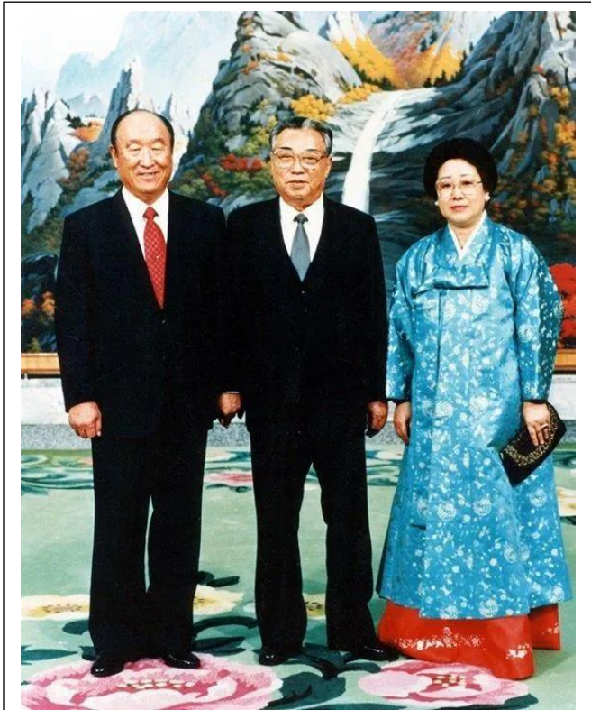
Father and Mother Moon with Kim Il-sung in Hungnam, North Korea Dec. 6, 1991

Now that has not changed and it's something that we can all unite around without fear.