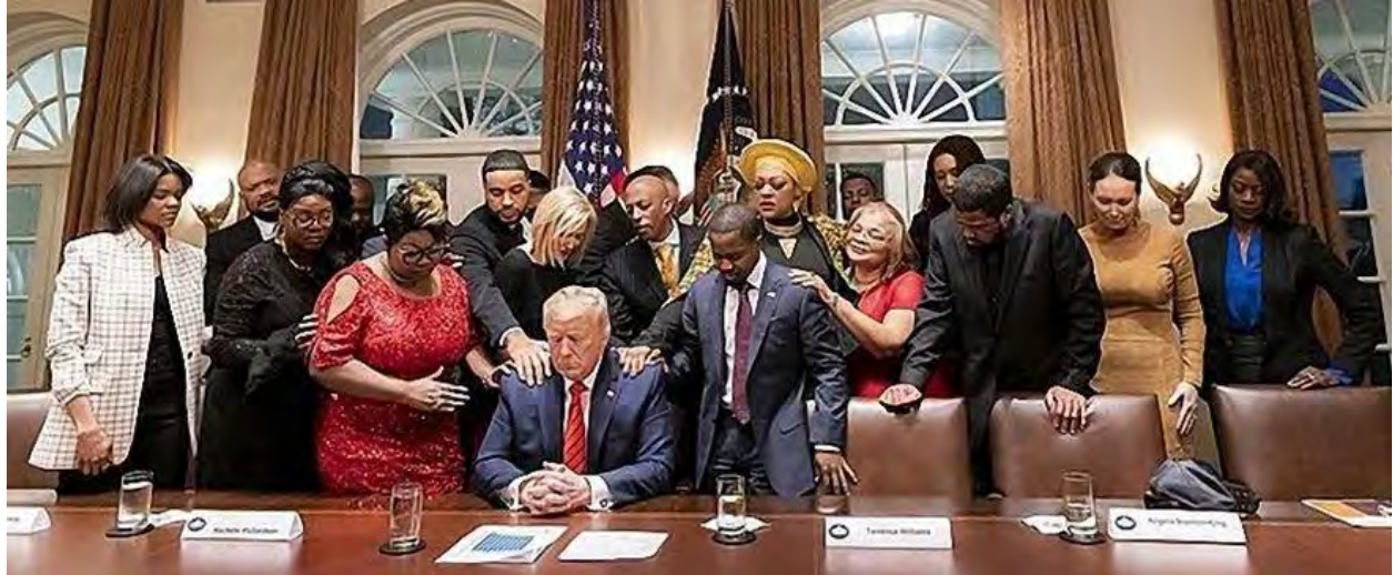
President Donald J. Trump participates in a prayer with African American Leaders and Pastor Paula White Thursday, Feb. 27, 2020, in the Cabinet Room of the White House

In late October 2024, just days before the U.S. presidential election, a gathering in the Atlanta suburbs of the key battleground state of Georgia attracted over 1,000 Christian pastors supporting Republican candidate and former President Donald Trump.