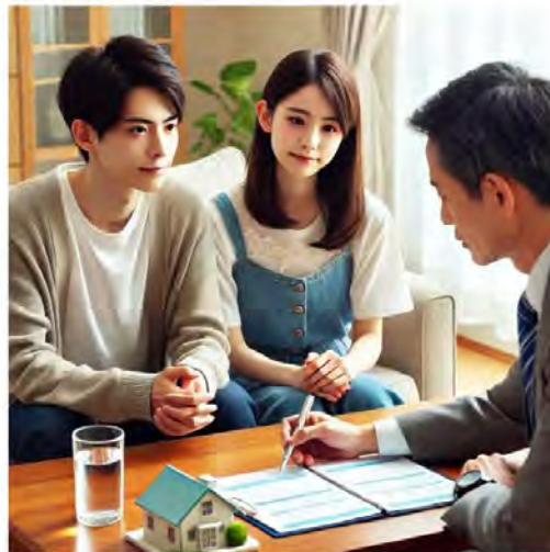
Family counselor with young couple.

A: There are likely various areas where people have been hurt, and we may not fully understand what the best form of mental health care is. However, we must do what we can. One initiative the organization undertook, albeit belatedly after this incident [ Editor's note: the assassination of former Prime Minister Shinzo Abe (安倍晋三) in July 2022 ], is the establishment of "Certified Family Counselors".