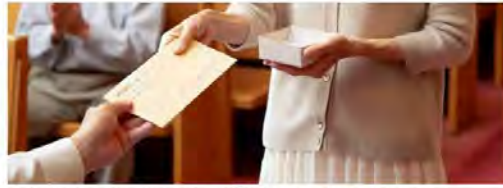
A Japanese woman offering a donation at a meeting.

person's financial situation. We repeatedly gave guidance on these points and insisted on transparency in evangelism by identifying the organization from the outset. As a result, the number of lawsuits dropped significantly.