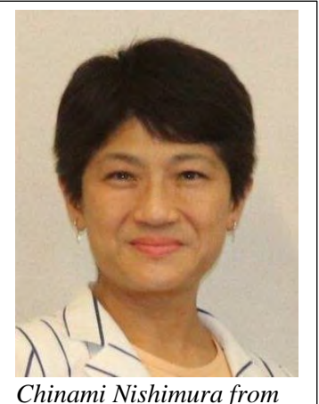
Chinami Nishimura from the Constitutional Democracy Party (CDP), Sept. 11, 2023

They were aware that Koide had been abducted and confined. However, the article published in the 16th September 1993 issue of the magazine made no mention of the abduction or confinement.