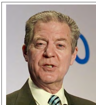
IRF Summit co-chair: Sam Brownback, US ambassador-at-large for international religious freedom 2018 - 2021. Here, at the IRF Summit in Washington DC 5th Feb. 5, 2025

A special pre-recorded video message presented 5th February at the International Religious Freedom (IRF) Summit 2025 in Washington DC, by senior American politician Newt Gingrich, former Speaker of the US House of Representatives.