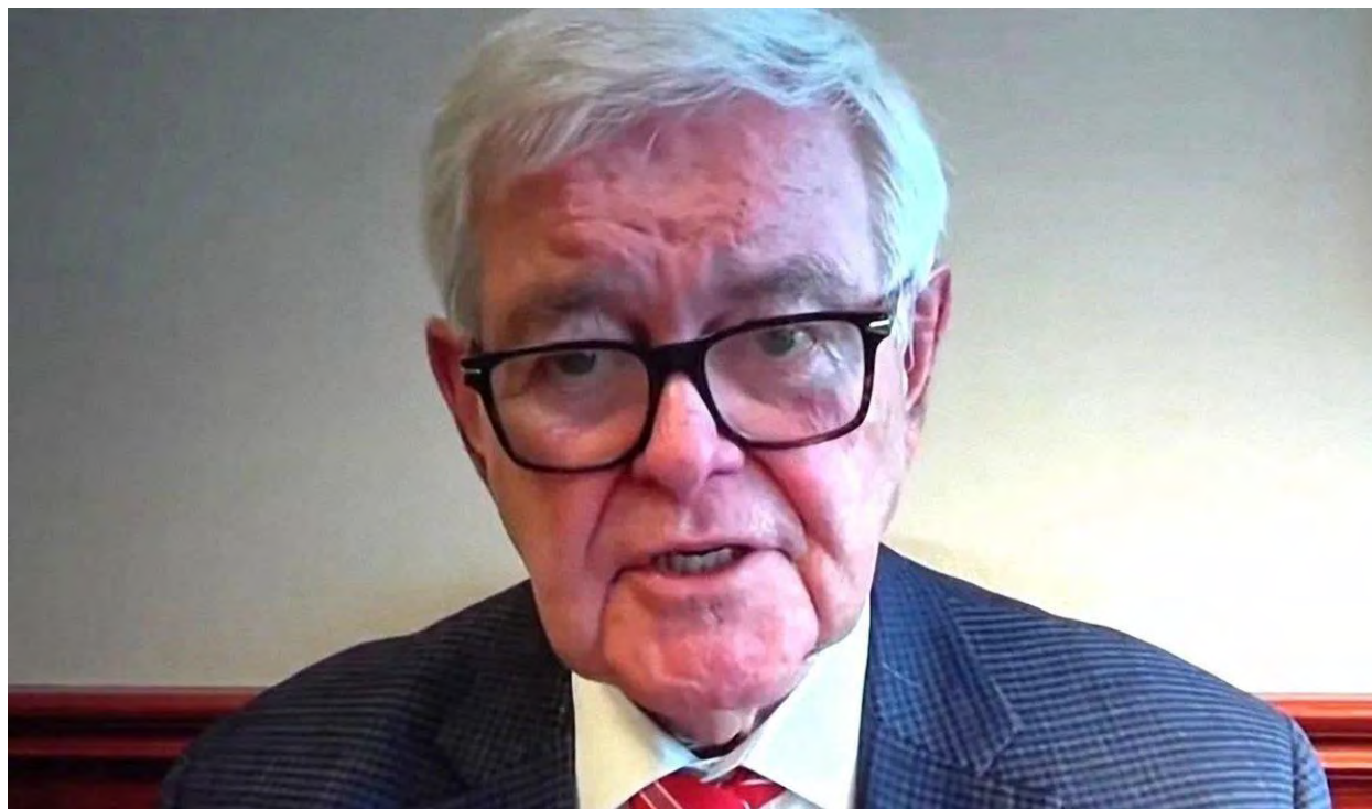
Newt Gingrich, former Speaker of the US House of Representatives, delivering a special pre-recorded video message 5th February 2025 at the International Religious Freedom (IRF) Summit 2025 in Washington DC