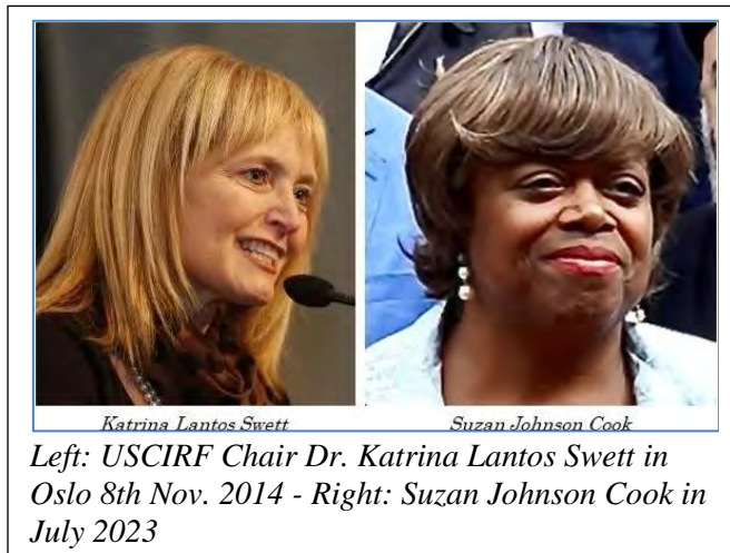
Left: USCIRF Chair Dr. Katrina Lantos Swett in Oslo 8th Nov. 2014 - Right: Suzan Johnson Cook in July 2023

"In a move that is much more reminiscent of current practices in China and Russia, Japan's government is now threatening to dissolve a legally constituted religious group for seemingly political purposes." (RealClear Politics 26th September 2023)