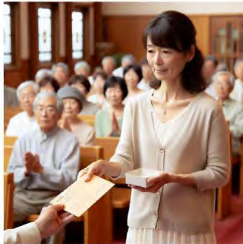
Anti-religious legislation allows relatives of donors to claim refund decades later! Here, a Japanese woman offering a donation at a meeting.

As seen in the Kawaguchi case, the media's relentless focus on criticizing the Family Federation has caused significant harm to society. In an environment where there is little tolerance for new religious movements, believers' past donations – made as religious acts – have now been reframed as cases of "financial fraud", fostering resentment among their relatives.