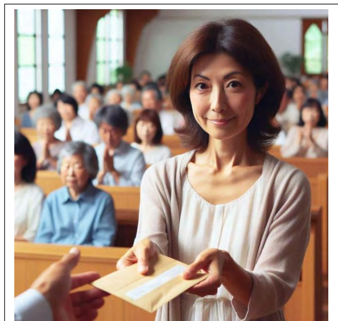
Anti-religious legislation allows relatives of donors to claim refund decades later! Here, a Japanese woman offering a donation at a meeting

Unrelated religious group's former member also included as a "victim"