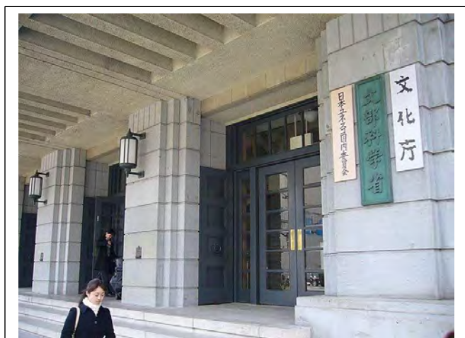
Former entrance of the Tokyo government building housing MEXT, the Japan Sports Agency, and the Agency for Cultural Affairs - Chiyoda, Tokyo

See also "Poorly Compiled Evidence Including Falsehoods"