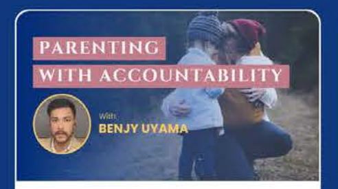
Parenting with Accountability with Benj...