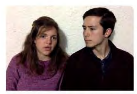
New Structure of School of Love High Noon