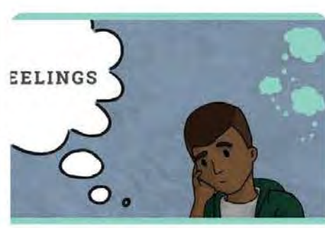
You and your feelings