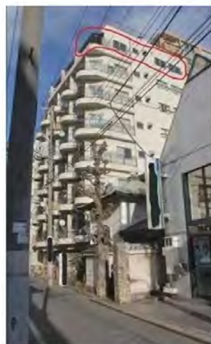
The location of the 8th floor apartment in Ogikubo, Tokyo where Toru Goto was held captive and dehumanized.

The group first headed to Ogikubo, where the apartment he had been confined in was located. As they approached, Goto paused and pointed to the corner unit on the eighth floor, saying, “That is the room where I was locked up for over 10 years. ” He added, “Many believers suffered abduction and confinement in places like this.” The apartment, located in a quiet residential area, had an eighth floor that was difficult to see from the ground, making escape nearly impossible. It was within this very room that the “ worst postwar human rights violation ”, as Goto calls it, took place.