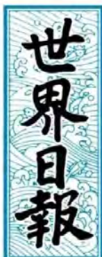
Logo of the Sekai Nippo

Victim of horrendous ordeal – more than 12 years long faith-breaking – suffered hellish existence of mental and physical torture